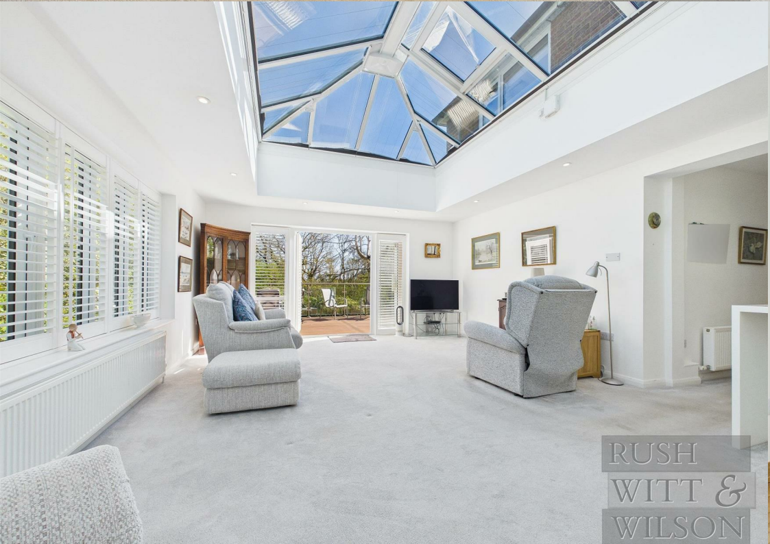
RUSH WITT & WILSON